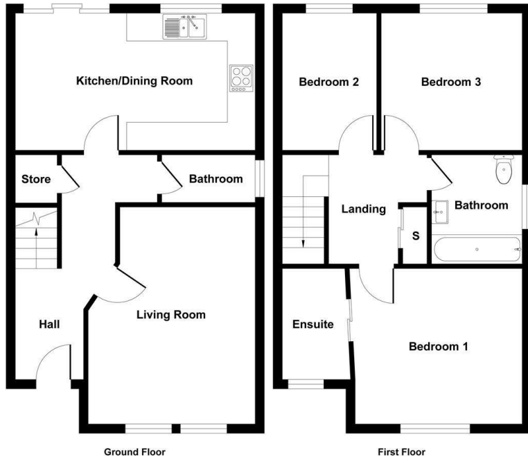
Illustration for identification purpose only, measurements approximate and not to scale, unauthorized reproduction is prohibited. All rights reserved for Alexander Hudson Estates